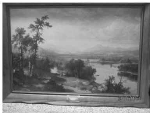
White Mountain Scenery

We also have two large prints -art panels - that were given to the school and would like to find new homes for them. The description follows: