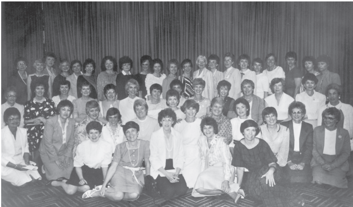
CLASS OF 1959 25 Year Celebration - 1984