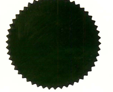
January 1, 2024 Date of Issue