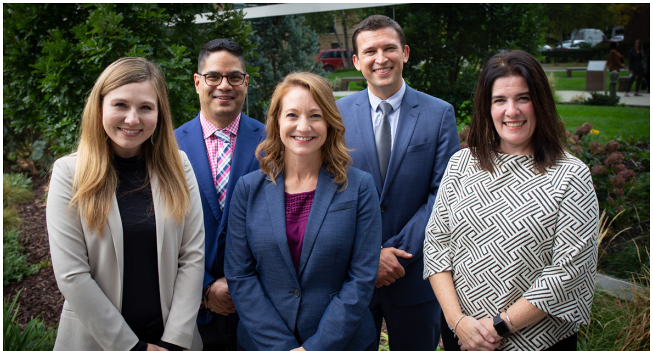
Pediatric Neuropsychology Faculty