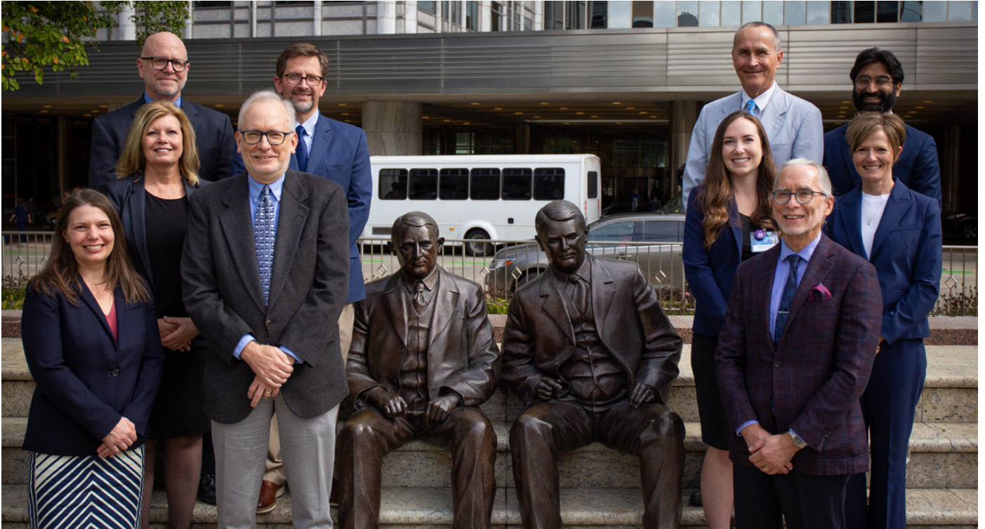
Adult Neuropsychology Faculty

“The best interest of the patient is the only interest to be considered.”